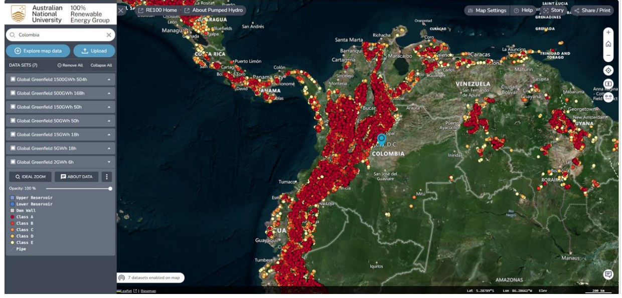
Figure 3: Screenshot of the Global Greenfield Pumped Hydro Energy Storage Atlas, showing parts of the PSP potential in Colombia

The screenshot below of this tool is giving an impression of the potential that Colombia is having.