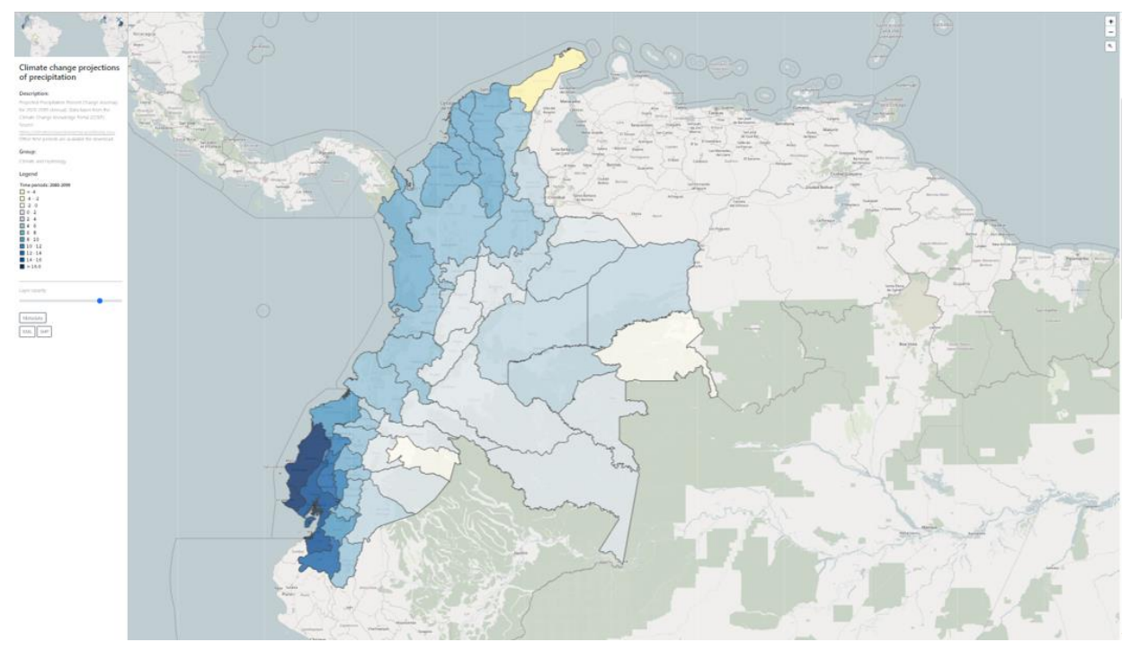
Figure 2: Screenshot of the HYPOSO Map, showing an increase of precipitation mainly Colombia's pacific coastal area, and a decrease in the far north

Measurements and predictions of precipitation patterns for Colombia give reason to expect a changed precipitation distribution in the future (see below the result from the HYPOSO Map, available via <u>https://www.hyposo.eu/en/hyposo-platform/</u>). It is recommended to think already now about addressing this issue to secure future water supply and protection (for the public and for agriculture). Multipurpose small hydropower plants with reservoirs might be a decentral answer for irregular precipitation scenarios in the future.